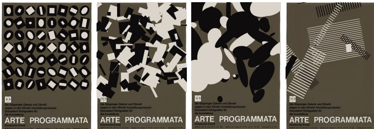
Figure 5: Alternative versions obtained by modifying code and tweaking variables.

Having gained an understanding of the "mechanics" of the code, Peter begins modifying the code itself. Now, more radical solutions emerge. The result of Peters' tinkering with his code as well as continued tweaking of the variables can be seen in figure 5.