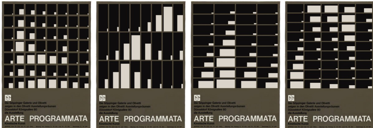
Figure 4: Alternative versions obtained by tweaking variables.

possible alternatives to the original specimen, obtained by tweaking the variables in his code, can be seen in figure 4.