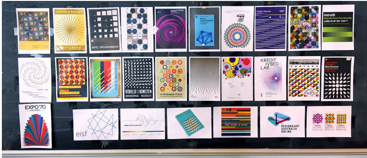
Figure 6: The collection of chosen specimens taped to the blackboard in the studio provided a quick visual overview.

As prescribed in the method, I chose a sample set of 20 pre-existing graphic design specimens from a curated collection [18]. The entire set of specimens made available as handouts and digital files to the students is shown in figure 6.