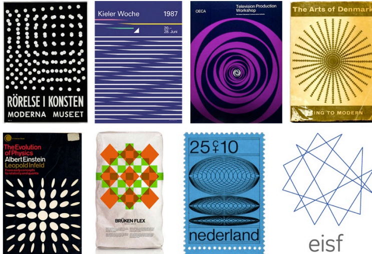
Figure 2: A selection of specimens suitable as material for the method.