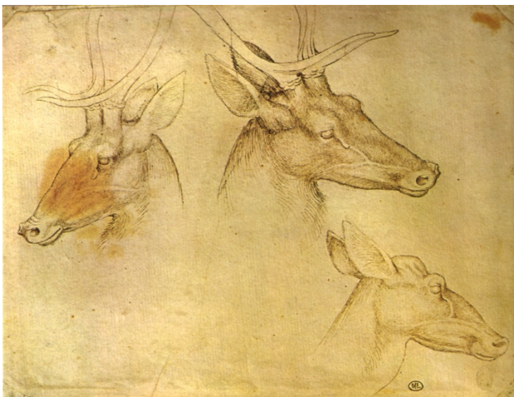
Drawing by Pisanello, Verona, at Louvre Museum