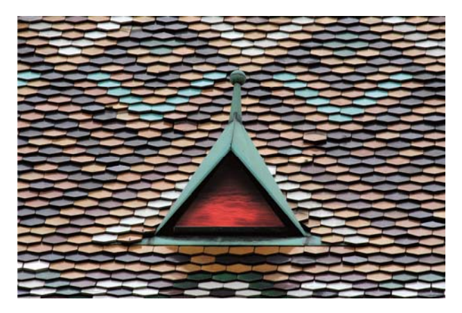
Photo 6. Mark II, 2011 (Jacek Papla)

As a result of fusion of particular media a polymedial composition is created. The interference between ars and techne determines its aesthetic value.