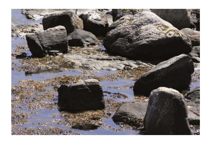
Photo 3. Runes II, 2011 (Jacek Papla)