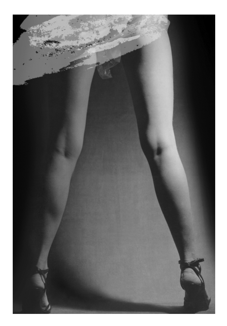
Photo 4. Spheres of sensitivity, 2007 (Jacek Papla)