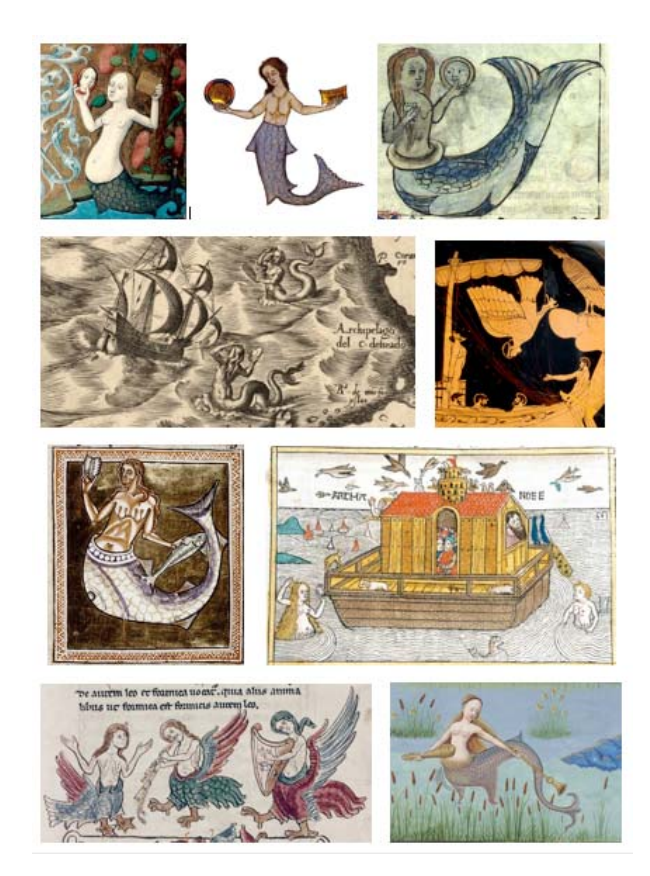
Figure 2. Collage of siren/mermaid evolution as described in Milliken's 2012 book and collected to facilitate student participation and discussion. Left to Right: Besançon, BM MS 69, Rouen, before

We happened upon mermaids almost by accident in a 2014 conversation about wet hair, about how hair's wet state is central to hair care logistics as the way that many of us wash and cut our hair. But just as central is the need to then dry your hair because wet hair is inappropriate (very disrespectful to go out like that!) and dangerous (you'll catch pneumonia!). Wet hair is inappropriate because it's so intimate, because it implies bathing and all other connotations of the private, bodily realm. And it was in this discussion that an attendee pointed out that mermaids' hair is always wet.