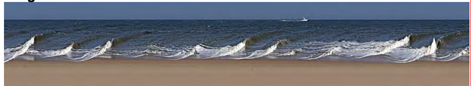
90 Seconds of Attention: View One