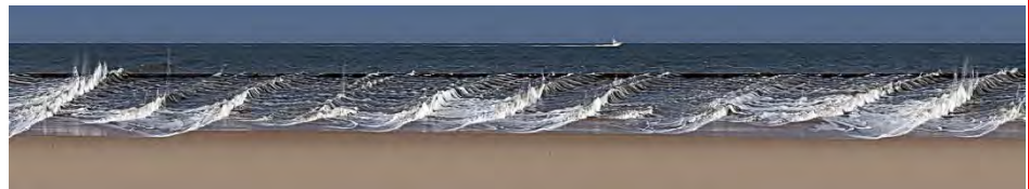
90 Seconds of Attention: View Two