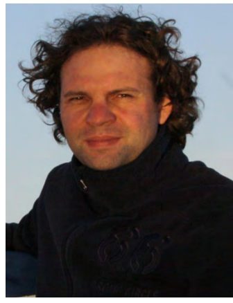
Topic: Generative Art, theory, design, architecture

Illusion of perception - artwork, performance, poster