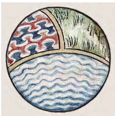
figure 1. John gower world vox clamantis detail [5]

The first example that I want to describe is about the discovery and general acceptance of the proposition that the earth is spherical. Exploration to date that, is 900 BC by the Greeks. But it is remarkable that before visual acceptance of spherical earth, different people have been different ideas and images from the earth that can be imagined as a wonderful example of Indian people. They thought the earth is surface on the shoulders of an elephant. While the acceptance of spherical earth have been different outputs of different nationalities. For example, in The Divine Comedy, Dante accepted assumption that the earth is round and by this default writes the Divine Comedy. Iranians are noteworthy example in the traditions that in some their traditional they emerge an apple into a container of water that is actually a symbol of the roundness of the earth and its movement. to Search art works and paintings with images of the Earth in the Middle Ages can be found some imagine that show a scientific exploration .