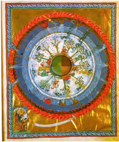
figure 2. Hildegard von bingen 'werk gottes' [6]

Another example that I want to talk about it, the law of gravity and Newton's discovery. The discovery in scientific history dates back to 1687 and appointed to Newton. Keep in mind that there is evidence that people had thought before Newton's law of gravity, and some believe that the discovery of gravity by Newton and the falling apple is an exaggeration! Also I must focus on that public expression of gravity has been by newton because newton by gravity illustrate same as falling an apple have been get a deep sentiment a bout gravity to people of society. clearly seen how a visual art express expanding the knowledge boundaries