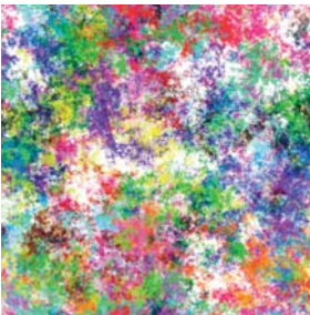
Figure 1: fillers at work

In this work we propose to introduce two different roles, namely outliner and filler, that ants or ant-like agents can play on a digital canvas, aiming at producing artworks that, although sketchy at this stage of our research, look promising in the pursue of generative art that resembles human-made drawings.