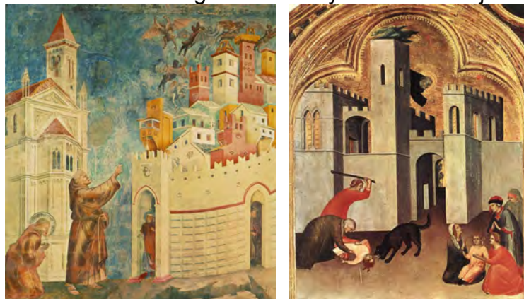
Giotto, “La cacciata dei demoni”, Simone Martini, “Beato Agostino Novello e il bambino azzannato dal lupo”

An explicit example of this approach are the tables and the frescoes by Giotto and Simone Martini. In these representations of medieval cities, each architectural event is represented by a different “perspective”, constructed with a subjective, ever-changing, virtual viewpoint that dynamically relates to one of multiple subjective paths for exploring the city. It seems that each architectural object follows one of possible subjective viewpoint able to underline a particular location in the urban image, or a point inside a discovering path in the represented environment. (C. Soddu, the not Euclidean image “L'Immagine non Euclidea”, Gangemi Pub. 1986). Looking at the urban images in these medieval artworks, and mentally reconstructing their whole urban geometry, each architecture appear as curved, physically transformed from “normal” orthogonal order by their own subjective perspective.