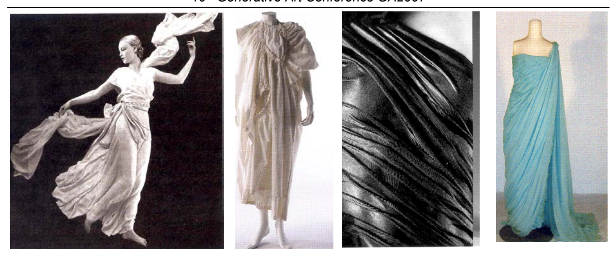
Figure 1. Real works of art, all inspired by the beauty of the Hellenic cloth. a: Madeleine Vionnet's "Living Statue", 1931; b: Rei Kawakubo dress, 1984; c: Issey Miyake Waterfall body, 1984; d: Jean Desses robes-manteaux, 1960.