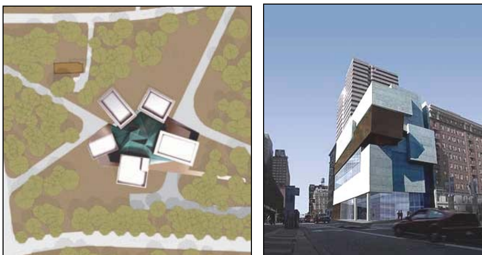
Figure 1: Durham ,Nasher Art Museum , Rafael Viñoly (left)

Some example for parametric design with change the parameters of multiple box and spatial relationship as rotation and transition in x ,y ,z direction, are shown, indeed they could simply designed in this way ,but never means this are designed so.