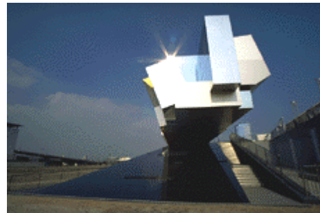
Figure 3 : Culver City ,Offices and 606 Parking Garage , Eric Owen Moss (left)