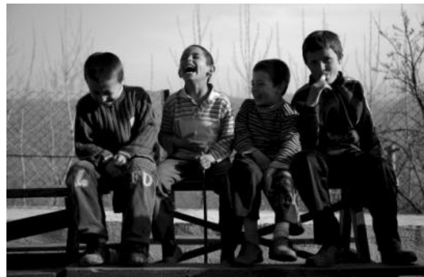
From left to right: Bursa- Türkiye.