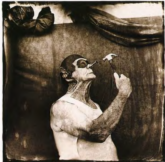
From left to right: Woman Once a Bird, 1990 [4]. Melvin Burkhardt Human Oddity, 1985, Thames& Hudson Ltd.

When a picture taken by the artist comes to daylight as a Witkin photograph as a result of his meticulous work in his dark room, it may be argued that they are highly similar only with each other as they are unique in the art of photography. The resulting photograph may be interpreted as symmetrical to itself under a one-to-one and onto transformation that maintains the existing structure (in the event that differences are at an indistinguishable level). In other words, that photo may be said to be automorphic.