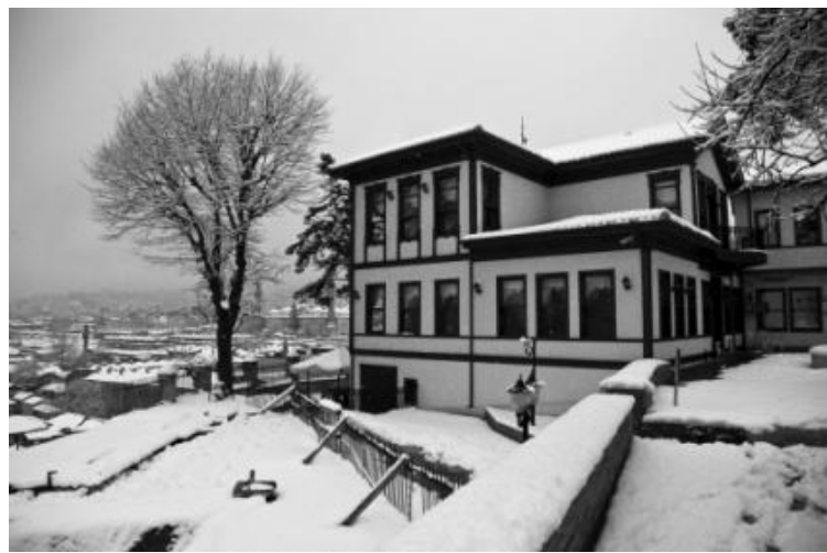
From left to right: Karadeniz, Bursa- Türkiye.