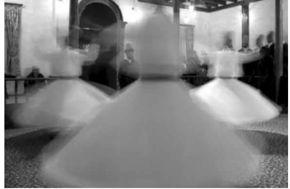
From left to right: Bursa- Türkiye.

Throughout history, scientific, technological and digital developments as well as their subsequent impacts on human life demonstrate that image takes part in art as a tool. In this process, the image produces its unique principles and terminology, which arises as a natural consequence of this situation. At this point, it will be appropriate to briefly tackle how to define image in art from the perspective of the examination.