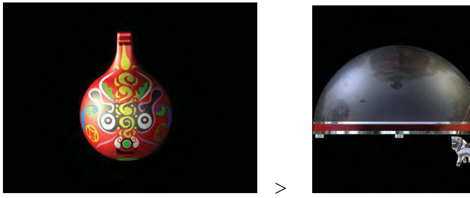
Figure 2: Translate and Transform an ancient horse bowl to a table lamp

emerging 3D printing techniques for revolutionizing the process of design and making of the future. Figure 2 is an example of translating and transforming an ancient horse bowl into a table lamp. Figure 3 is an example involving a combination of generative act (translation, transform, and transcending) that requires collaboration and integration; Figure 4 is a 3D printable outcome of our Rtttl model in which more cultural characters are introduced into generative design process.