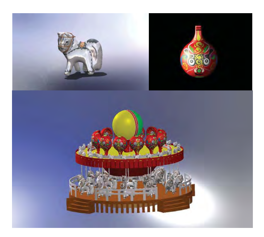
Figure 3: Translating, transforming and transcending the original design genes into products that require collaboration within the generative design and making framework