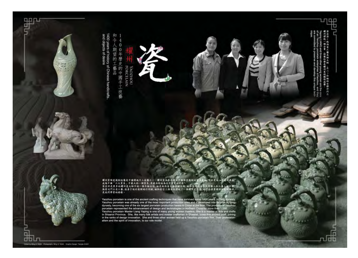
Figure 6: Yaozhou Ceramic works have great potential for generative design and 3D printing which is our next project of this research team.

At Generative Art 2014, we came as a big group from Shaanxi province in order to introduce Qin Opera and our initial exploration of generative music with Qin opera with both Chinese and western violins.