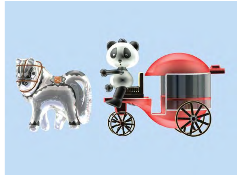
Figure 4: Many variations of designs can be generated and 3D printed with generative design framework combining cultural elements and design genes.