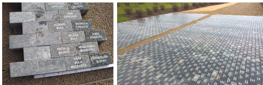
Fig. 9 The first stones, cobbled in the path of the Apple-tree Alley (source: http://laikraksts.com/raksti/foto/LL258/Liktendarzs_394.jpg )

In 2012, the first 1 000 stones were cobbled in the path of the Apple-tree Alley. The path was covered with grey pavement (Fig. 9), applying boulders, which were searched for all over Latvia. Mostly the dark grey ones were necessary, which were envisaged in the design of the Garden of Destiny (Fig. 10). First of all, they were looked for in the nearest neighbourhood, as transportation of big stones is expensive.