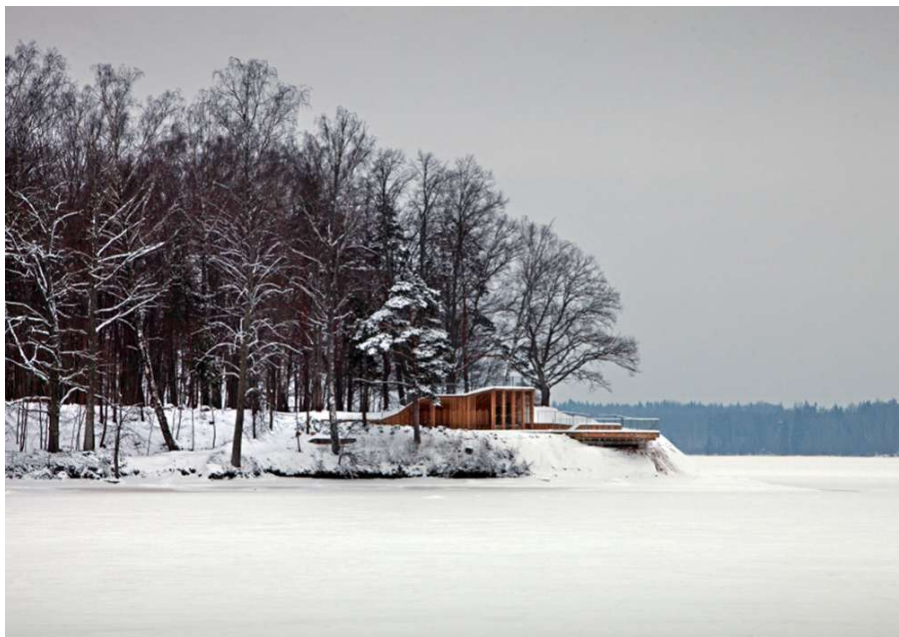
Fig. 16 The Garden of Destiny and the View Terrace in wintertime

Not far from the View Terrace, the Hiroshima Peace Stone (Fig. 17), presented to the patron of the Garden of Destiny, President of the Republic of Latvia Valdis Zatlers, was placed on May 25, 2010, which is calling for peace all over the world. The unique heart-shape boulder, chosen by sculptor Ojārs Feldbergs – the Heart Stone (Fig. 18), has become the symbol of love of the Garden of Destiny and beloved place for wedding ceremonies. It calls you to feel the energy of stones accumulated through centuries and enjoy the picturesque landscape. Not far from there the Wedding Grove has been created, where newly-weds plant trees on their special day.