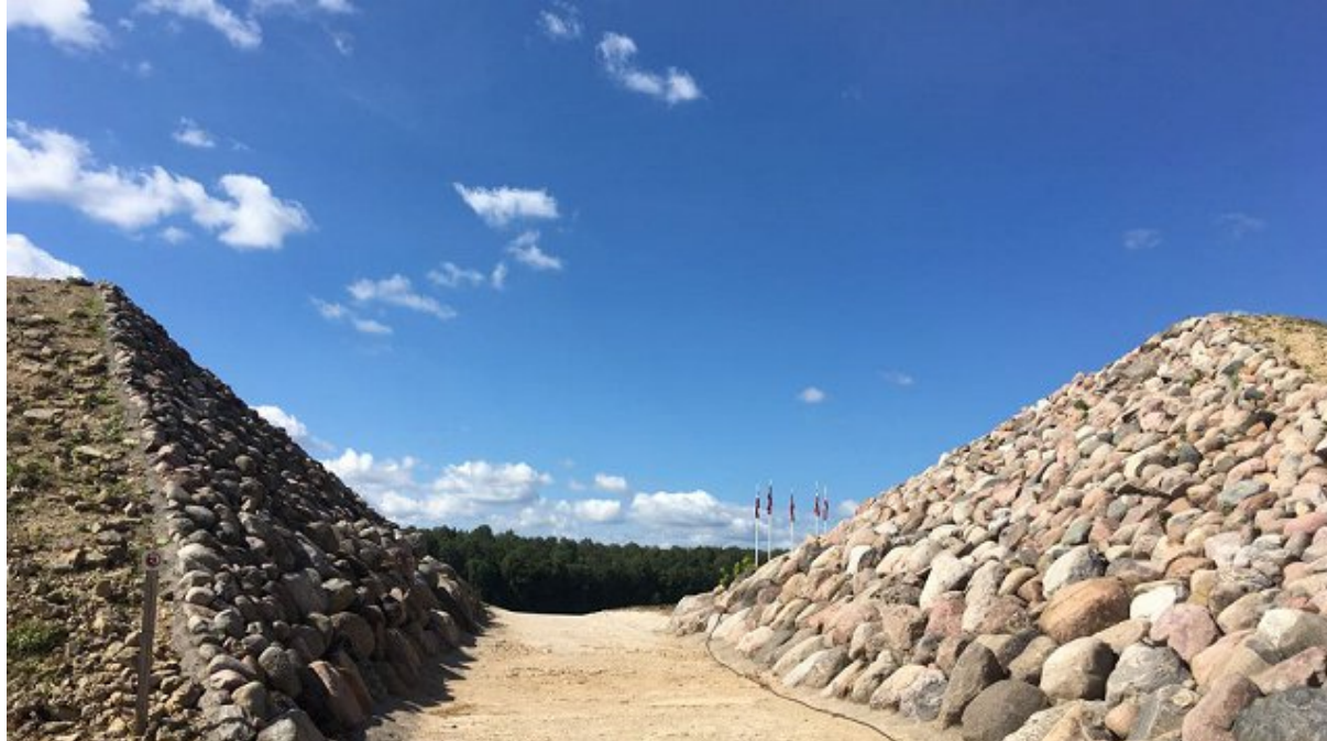
Fig. 21 Amphitheatre consists of more than 50 000 boulders