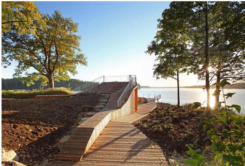
Fig. 12 The roof of the View Terrace for looking at the River Daugava

In August, “Dreamway” Ltd. under Andris Ozoliņš’s guidance started to build the View Terrace (Fig. 12), architecturally conforming to the forest relief of the Garden of Destiny, which is the result of lots of people and countries’ good will and cooperation, where one can feel the flow of time and find their strength.