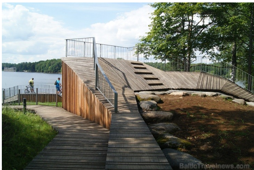
Fig. 14 Two levels of the View Terrace

Two paths take to the terrace (Fig. 14, 15), which wind on two levels – one of them reaches the Daugava, but the other one merges with the building and takes to the roof of the View Terrace. The first permanent building of the Garden of Destiny – the View Terrace (Fig. 16), which was opened for public on November 9, received the Latvian Architecture Award. The greenery of the terrace was made by Romāns Streļčūns, the specialist from Dendroflora Department of the National Botanical Garden of Latvia and project manager Bruno Cīrulis. The photo of the View Terrace was published in the international landscape magazine “International New Landscape” in the autumn, 2015.