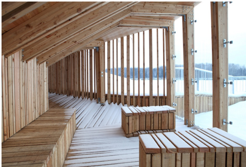
Fig. 13 Interior view of the View Terrace