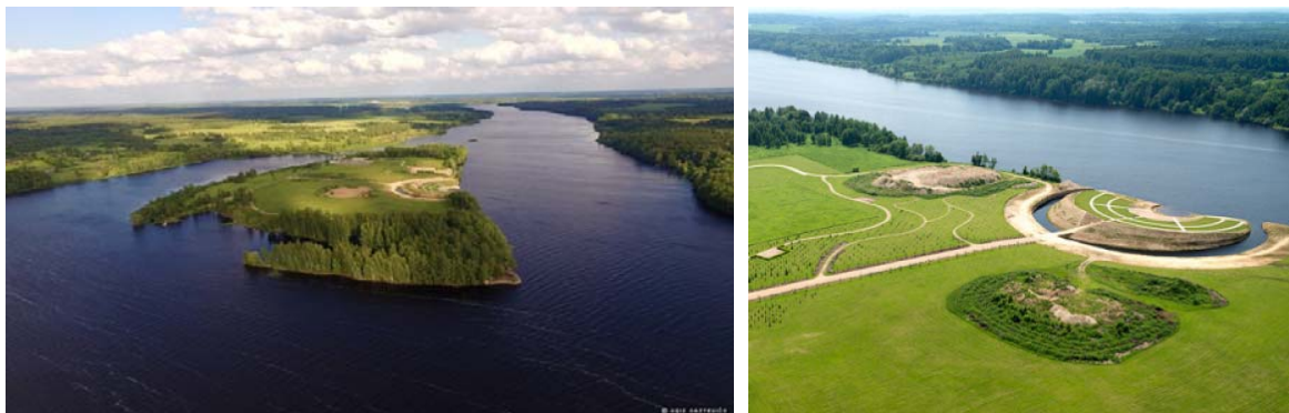
Fig. 7 The central part of the garden – the Amphitheatre at the Daugava

planted, and every apple-tree has got the planter's message to someone close person or group of people. Romantic apple-trees surrounded the life artery of the Garden of Destiny and it takes to the central part of the garden – the Amphitheatre at the Daugava (Fig. 7). President (1993–1999) of the Republic of Latvia Guntis Ulmanis together with his grandson planted one of the first apple-trees. Since December 11, 2008 President (2007–2011) of the Republic of Latvia Valdis Zatlers has been the guardian of the Garden of Destiny.