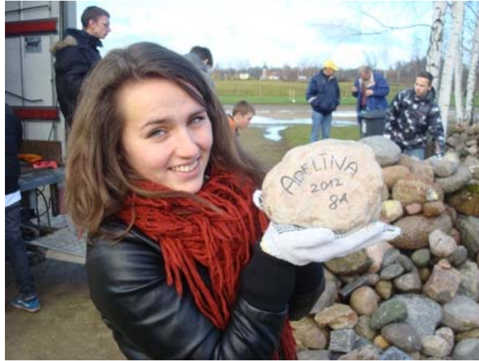
Fig. 11 Everybody was leave their wish to Latvia

In August, “Dreamway” Ltd. under Andris Ozoliņš’s guidance started to build the View Terrace (Fig. 12), architecturally conforming to the forest relief of the Garden of Destiny, which is the result of lots of people and countries’ good will and cooperation, where one can feel the flow of time and find their strength.