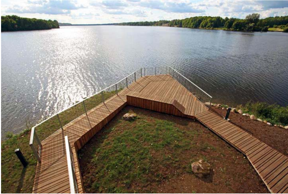
Fig. 15 Two paths take to the terrace