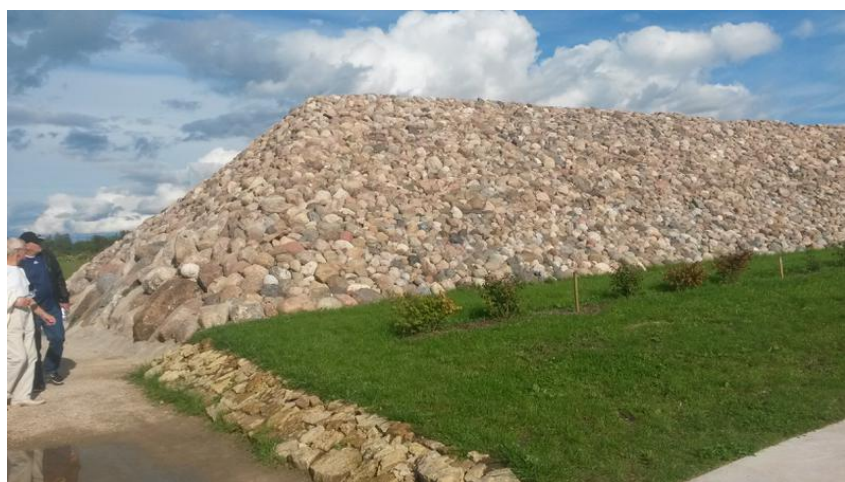
Fig. 22 The stone layer