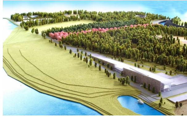
Fig. 5 The sketch project of the Garden of Destiny (architect Shunmyō Masuno)