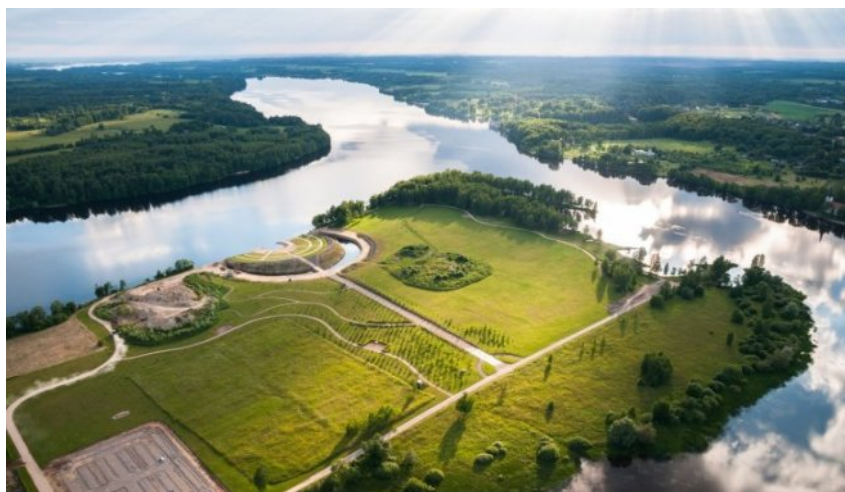
Fig. 26 Overview of the Garden of Destiny in spring 2016. An outstanding environmental architecture with nature of the island and beauty of the Daugava's flow have been combined