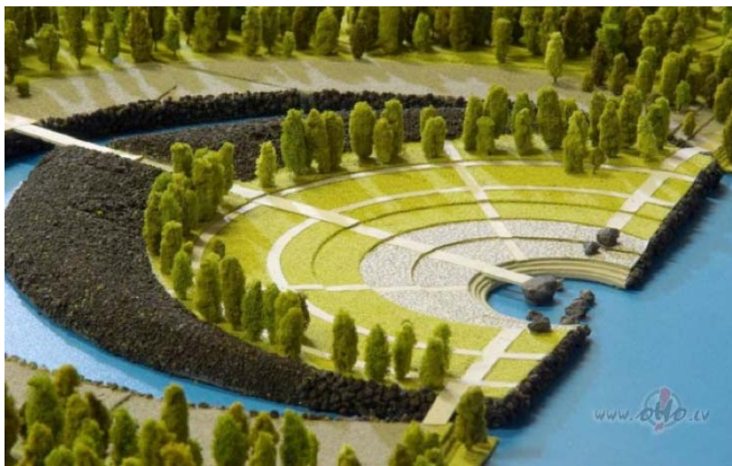
Fig. 19 The model of the Amphitheatre

The stone, located separately from the others, must be with character, so that one would like to look at it. Raw and processed stones are used for paving and bridges. From 2013 till 2017, the Latvian Association of the Politically Repressed Persons together with 72 members of Latvia municipalities planted 40 oak-trees. In order to commemorate the politically repressed ones from their towns and regions they formed the guard of honour around the Amphitheatre (2010–2018), which concentrates in itself the blooming love of the Apple-tree Alley, eternal peace of the stone layer and power of the donated stones and separates symbolically the past and future part of the garden. The grey stone layer “Silver Sunset” around the Amphitheatre consists of more than 50 000 boulders (Fig. 20), which were taken there by inhabitants of Latvia for their relatives and family remembrance. The River of Tears (Fig. 19) flows along the external side of the stone layer (Fig. 21, 22) and symbolizes victims’ tears and faith that what happened in the past will never ever recur. To arrive in the heart of the Garden of Destiny, one has to let the river with its eternal and soothing water flow to find consolation.