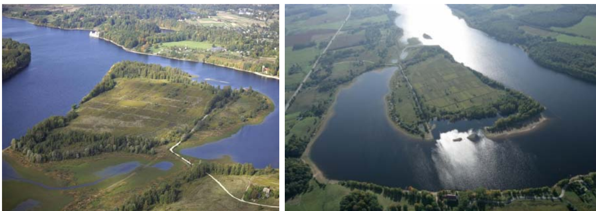
Fig. 1 The Island Krievkalns in the middle of the River Daugava

There is archaeological evidence of wars including World War One, 1914, which has left its mark of trenches in the garden territory. It is a place, which tells us symbolically how much the freedom and independent state cost the Latvian nation, at the same time also confirming independence and power of the Latvian nation, which has enabled them to endure and look with hopes into the future (Fig. 2).