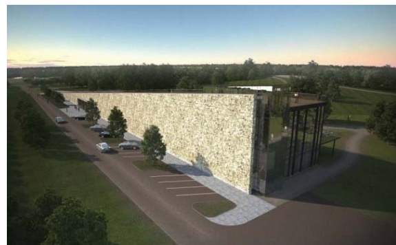
Fig. 24 Construction of the multifunctional public building