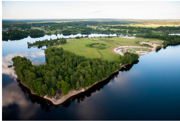
Fig. 23 Overview of the Garden of Destiny in 2015