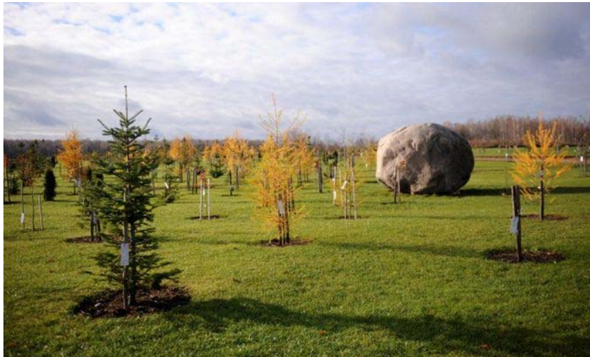
Fig. 17 the Hiroshima Peace Stone