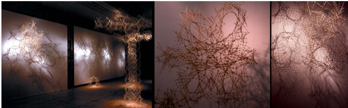
Figure 8: © M. Báez, The Phenomenological Garden , previous exhibition inspired by Leonardo's Deluge drawings.