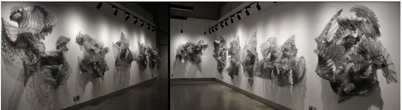
Figure 5: © M. Báez, Diluvio: Teatro delle Ombre , exhibition highlighting the sculptures.