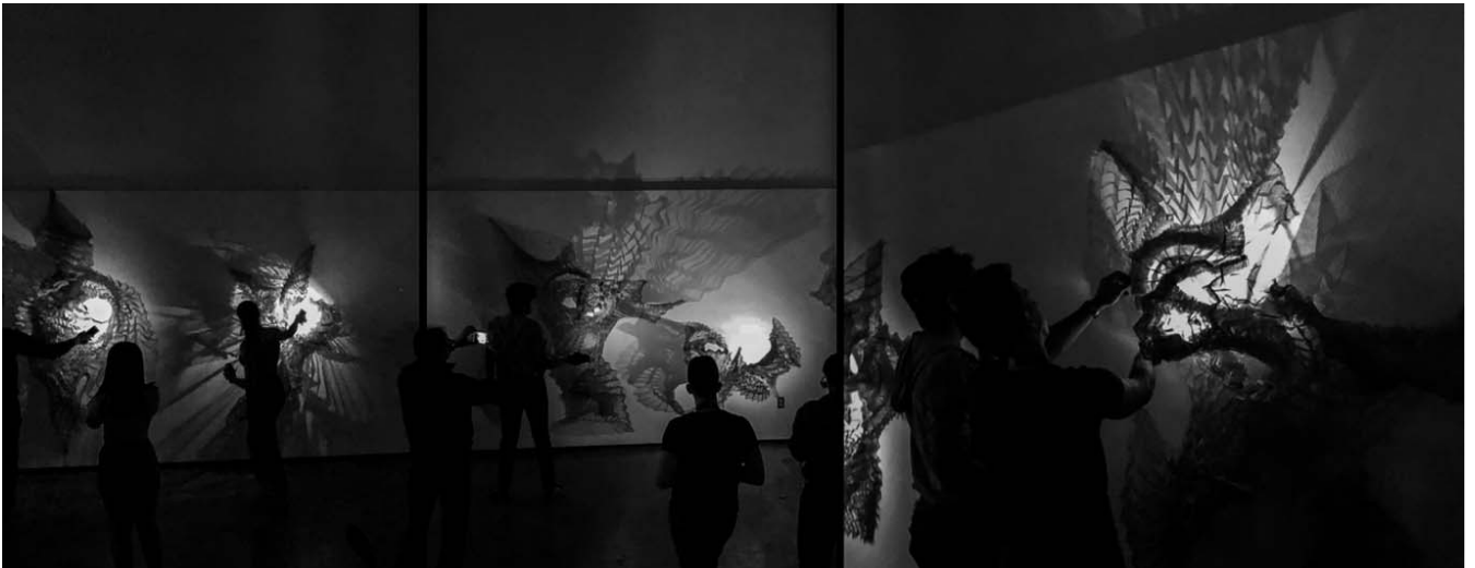
Figure 2: © M. Báez, Diluvio: Teatro delle Ombre , interactive shadow-projections and sculptures.