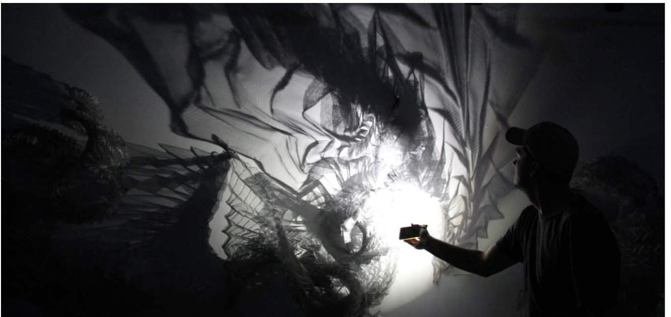
Figure 3: © M. Báez, Diluvio: Teatro delle Ombre , interactive shadow-projection and sculpture details.