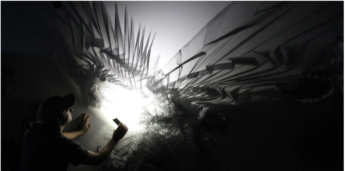
Figure 4: © M. Báez, Diluvio: Teatro delle Ombre , interactive shadow-projection and sculpture details.