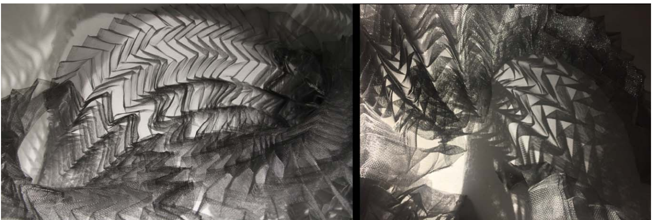
Figure 6: © M. Báez, Diluvio: Teatro delle Ombre , interactive shadow-projection and sculpture details.