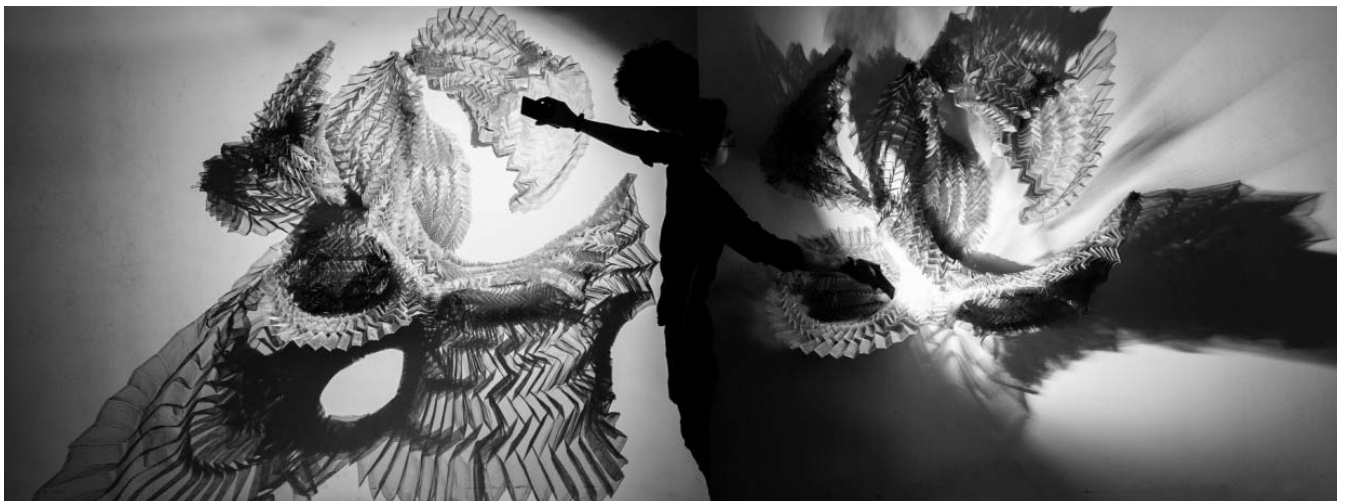
Figure 1: Diluvio: Teatro delle Ombre, interactive shadow-projections.

Teatro delle Ombre offered students an experientially generative working-process whereby they were able to construct fluidly sculptural configurations while simultaneously understanding how the malleability of the folded membrane was achieved. The inherent dynamism of the conceived sculptures was activated and revealed through a moving light source (i.e., the cellphone flashlight) and the projected shadows. These mysteriously evocative shadow-projections and their related visual activations, " if you consider them well, " as Leonardo has reminded us, " you may find really marvelous ideas ... because by indistinct things the mind is stimulated to new inventions. " Thus, with this insightful offering in mind, students and the public were encouraged to ponder and interpret the elusively evocative forms, shadows and resonant patterns generated through Diluvio: Teatro delle Ombre as a way of stimulating and expanding their imagination and of gaining insights into the inner workings of the mind and perception.