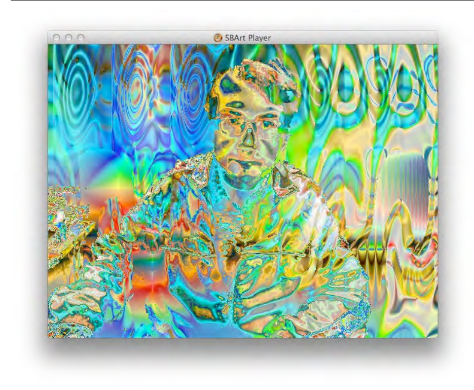
Figure 3. Mixing visitor's figure with generated image using Kinect® camera.