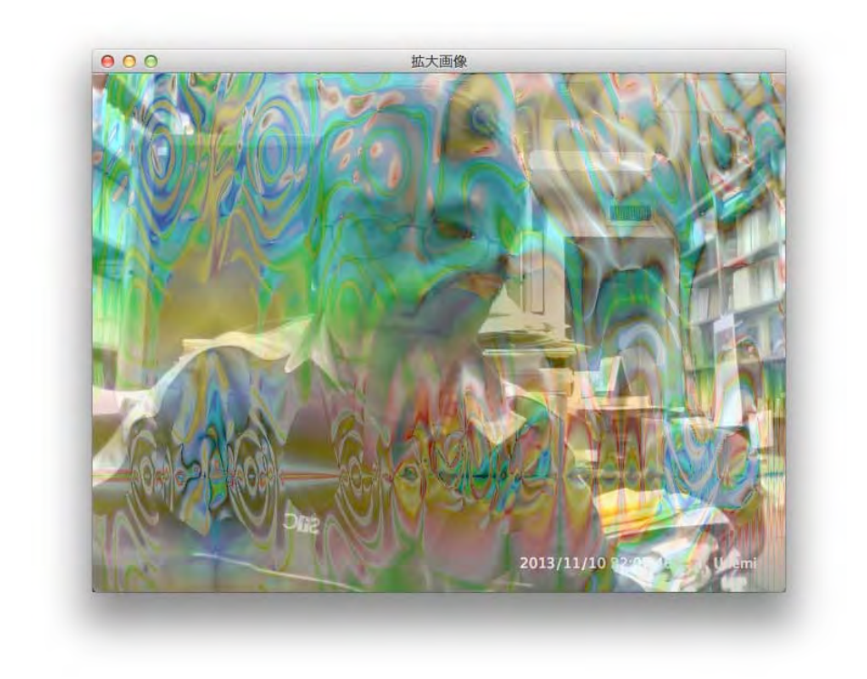
Figure 1. A simple mixture of generated image and captured image by taking the average color values for each pixel.