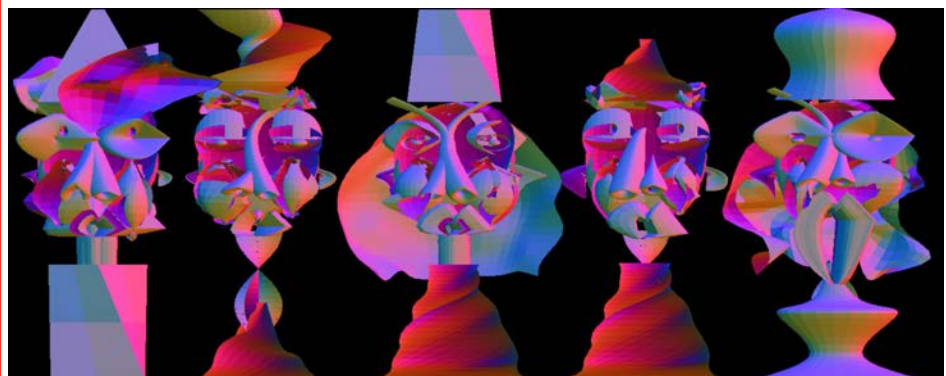
Five portraits of "D'apres Francis Bacon" by Celestino Soddu

The aim was to arrive to a sequence of possible variations where each portraits is strongly identifiable as a possible interpretation of Francis Bacon portraits. But this is clear only in a first step. More, each generated portraits could be strongly identifiable as belonging to my artist vision.